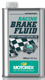
RACING BRAKE FLUID

High-performance brake fluid for the highest level off-road racing. High dry and wet boiling points (563°F/383°F, 295°C/195°C). Easily exceeds DOT 4 specifications.