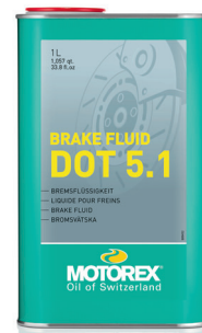
BRAKE FLUID DOT 5.1

Superior brake fluid with a wet boiling point of more than 165°C. Prevents the formation of vapor even at extreme braking loads.