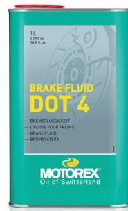
BRAKE FLUID DOT 4.

High-performance brake fluid for the highest level off-road racing. High dry and wet boiling points (563°F/383°F, 295°C/195°C). Easily exceeds DOT 4 specifications.